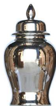
PRODUCT CODE: JING-084925X-F DESCRIPTION: 19" JAR MODEL NO: JCU-1365 DIMENSION: DIA. 25 X 46 H CM. FINISH COLOR: SILVER CLASSIFICATION : CLASSIC