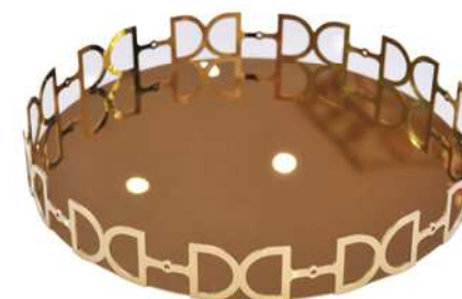
PRODUCT CODE: LIO -091827X-F DESCRIPTION: TRAY MODEL NO: MS3905S DIMENSION: 30 X 5 H CM. CLASSIFICATION : TRANSITIONAL