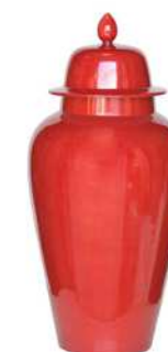
PRODUCT CODE: JING-084918X-F DESCRIPTION: 24" JAR MODEL NO: JCU-1168 DIMENSION: DIA. 28 X 60 H CM. FINISH COLOR: RED CLASSIFICATION : CLASSIC