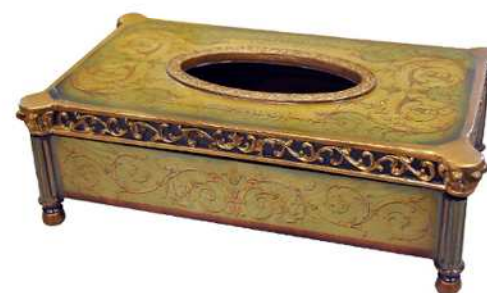
PRODUCT CODE: ANA -084553X-F DESCRIPTION: DECORATIVE TISSUE BOX MODEL NO: RS-F1279-WBQC-M DIMENSION: 32 X 19 X 10 H CM. CLASSIFICATION : CLASSIC