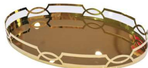
PRODUCT CODE: LIO -091815X-F DESCRIPTION: TRAY MODEL NO: MS4042L DIMENSION: 45 X 29 X 5 H CM. FINISH COLOR: STAINLESS STEEL CLASSIFICATION : TRANSITIONAL