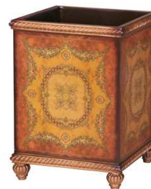
PRODUCT CODE: ANA -084605X-F DESCRIPTION: WASTE PAPER BUCKET MODEL NO: RS-1717-WBZD-M DIMENSION: 23 X 23 X 32 H CM CLASSIFICATION : CLASSIC