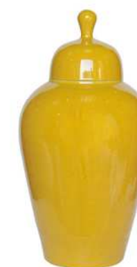
PRODUCT CODE: JING-084935X-F DESCRIPTION: 14" JAR MODEL NO: JCU-1159 DIMENSION: DIA. 22 X 39 H CM. FINISH COLOR: GOLD CLASSIFICATION : CLASSIC