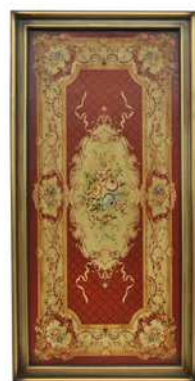
PRODUCT CODE: ANA -084474X-F DESCRIPTION: HANGING PANEL MODEL NO: LP-E0896-LAGY-M DIMENSION: 60 X 3 X 116 H CM. CLASSIFICATION : CLASSIC