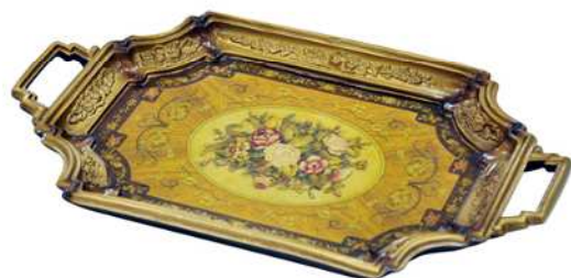
PRODUCT CODE: ANA -084621X-F DESCRIPTION: DECORATIVE TRAY MODEL NO: RS-0924-WBVO-M-228 DIMENSION: 34 X 21 X 2.5 H CM. CLASSIFICATION : CLASSIC