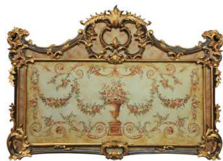
PRODUCT CODE: ANA -084472X-F DESCRIPTION: DECORATIVE PANEL MODEL NO: LP-A0879-LALW-M DIMENSION: 159 X 5 X 115 H CM CLASSIFICATION : CLASSIC