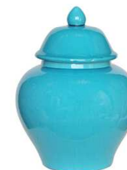
PRODUCT CODE: JING-084931X-F DESCRIPTION: 17" JAR MODEL NO: JCU-1089 DIMENSION: DIA. 34 X 45 H CM. FINISH COLOR: TURQUES CLASSIFICATION : CLASSIC