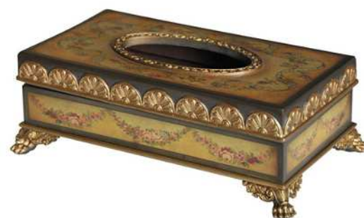
PRODUCT CODE: ANA -084548X-F DESCRIPTION: TISSUE BOX MODEL NO: RS-E1248-WARS-M DIMENSION: 30.5 X 17 X 10.5 H CM CLASSIFICATION : CLASSIC