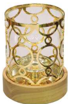
PRODUCT CODE: LIO -091810X-F DESCRIPTION: CANDLE HOLDER MODEL NO: MZ4080S DIMENSION: DIA. 16 X 19.5 H CM. FINISH COLOR: METAL+GLASS CLASSIFICATION : TRANSITIONAL