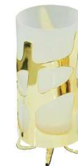
PRODUCT CODE: LIO -091824X-F DESCRIPTION: CANDLE HOLDER MODEL NO: MZ3959S-A DIMENSION: DIA. 14 X 31 H CM. CLASSIFICATION : TRANSITIONAL