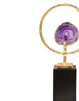
PRODUCT CODE: LIO -091821X-F DESCRIPTION: DECORATION MODEL NO: MS4058L DIMENSION: 19 X 10 X 38 H CM. CLASSIFICATION : TRANSITIONAL