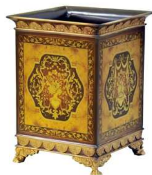
PRODUCT CODE: ANA -084620X-F DESCRIPTION: WASTEBIN MODEL NO: RS-1731-WBZJ-M DIMENSION: 24 X 24 X 33.5 H CM. CLASSIFICATION : CLASSIC