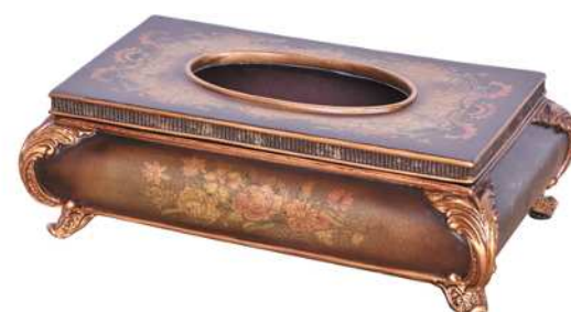
PRODUCT CODE: ANA -084546X-F DESCRIPTION: JEWELRY BOX MODEL NO: RS-1285-WBBN-M-27 DIMENSION: 32 X 19 X 10 H CM. CLASSIFICATION : CLASSIC