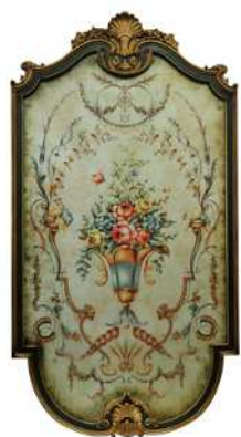
PRODUCT CODE: ANA -084473X-F DESCRIPTION: DECORATIVE PANEL MODEL NO: LP-A0897-LAMI-M DIMENSION: 80 X 83 X 149 H CM. CLASSIFICATION : CLASSIC