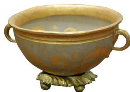
PRODUCT CODE: BOU -092961X-F DESCRIPTION: BOWL MODEL NO: SI1149 DIMENSION: DIA. 36.5 X 24 H CM. CLASSIFICATION : CLASSIC