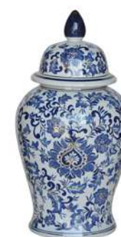
PRODUCT CODE: JING-084930X-F DESCRIPTION: 18" JAR MODEL NO: JCD-7148 DIMENSION: DIA. 24 X 46 H CM. CLASSIFICATION : CLASSIC