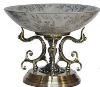
PRODUCT CODE: JING-084940X-F DESCRIPTION: 14.5" BOWL MODEL NO: JCY-7425 DIMENSION: DIA. 35 X 28 H CM. CLASSIFICATION : CLASSIC