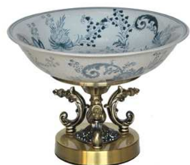
PRODUCT CODE: JING-084941X-F DESCRIPTION: 12" PLATE MODEL NO: JCD-7194 DIMENSION: DIA. 30.5 X 24 H CM CLASSIFICATION : CLASSIC