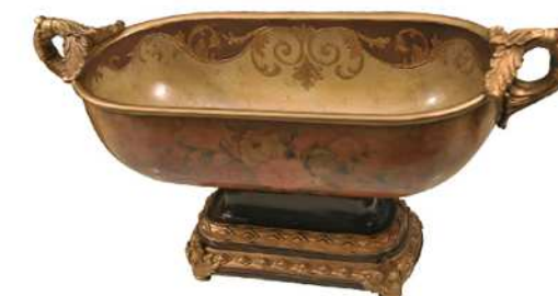
PRODUCT CODE: ANA -084600X-F DESCRIPTION: DECORATIVE BOWL MODEL NO: EP-0441-EALR-M DIMENSION: 44 X 17.5 X 23.5 H CM. CLASSIFICATION : CLASSIC