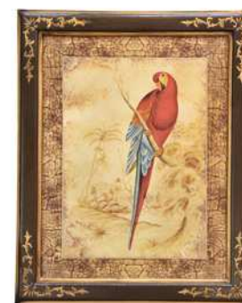
PRODUCT CODE: ANA -084475X-F DESCRIPTION: HANGING PANEL MODEL NO: LP-J0360-LAGG-M DIMENSION: 42 X 52.5 H CM. CLASSIFICATION : CLASSIC