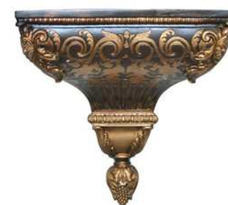
PRODUCT CODE: ANA -084504X-F DESCRIPTION: DECORATIVE HOLDER MODEL NO: RS-0437-WAOL-M DIMENSION: 23X15X22H CM CLASSIFICATION : CLASSIC