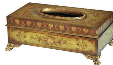
PRODUCT CODE: ANA -084550X-F DESCRIPTION: FACIAL TISSUE BOX MODEL NO: RS-F1419-WAMV-M DIMENSION: 30 X 17.5 X 11 H CM. CLASSIFICATION : CLASSIC