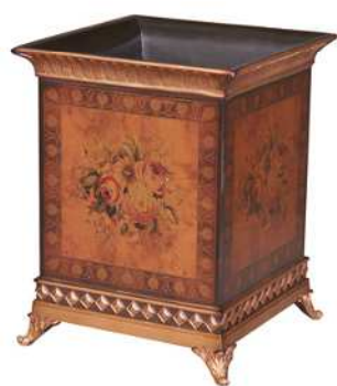
PRODUCT CODE: ANA -084607X-F DESCRIPTION: WASTEBIN MODEL NO: RS-A1680-WBYR-M-56 DIMENSION: 25 X 25 X 33 H CM CLASSIFICATION : CLASSIC