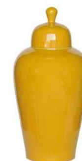
PRODUCT CODE: JING-084919X-F DESCRIPTION: 17" JAR MODEL NO: JCU-1158 DIMENSION: DIA. 23 X 47 H CM. FINISH COLOR: GOLD CLASSIFICATION : CLASSIC