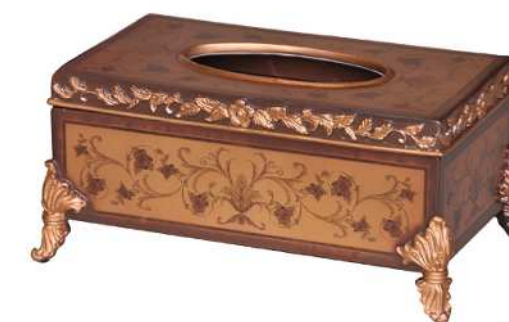
PRODUCT CODE: ANA -084606X-F DESCRIPTION: TISSUE BOX MODEL NO: RS-A1615-WBVR-M-27 DIMENSION: 30 X 18 X 14 H CM CLASSIFICATION : CLASSIC