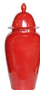
PRODUCT CODE: JING-084921X-F DESCRIPTION: 18.5" JAR MODEL NO: JCU-1169 DIMENSION: DIA:23X51H CM. FINISH COLOR: RED CLASSIFICATION : CLASSIC