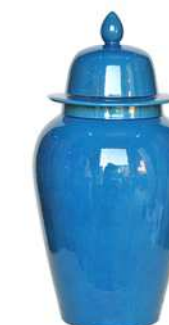
PRODUCT CODE: JING-084920X-F DESCRIPTION: 15" JAR MODEL NO: JCU-1175 DIMENSION: DIA. 21 X 41 H CM. FINISH COLOR: BLUE CLASSIFICATION : CLASSIC