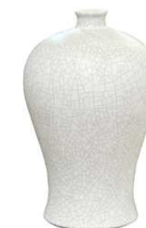
PRODUCT CODE: JING-084964X-F DESCRIPTION: JAR MODEL NO: JCD-8983 DIMENSION: 20 X 24 H CM. CLASSIFICATION : CLASSIC