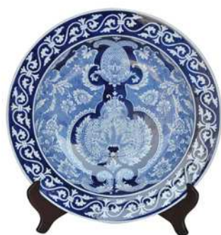
PRODUCT CODE: JING-084942X-F DESCRIPTION: 18" PLATE W/WOODEN BASE MODEL NO: JCD-5740 DIMENSION: 46 X 15 X 48 H CM. CLASSIFICATION : CLASSIC