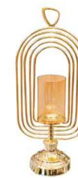
PRODUCT CODE: LIO -091826X-F DESCRIPTION: CANDLE HOLDER MODEL NO: MZ4201 DIMENSION: 15 X 13 X 42 H CM. CLASSIFICATION : TRANSITIONAL