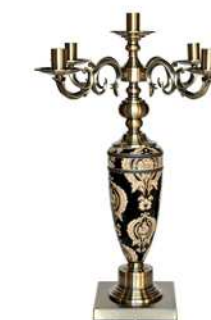
PRODUCT CODE: JING-084945X-F DESCRIPTION: 26" CANDLE HOLDER MODEL NO: JCY-8169 DIMENSION: 39 X 39 X 65 H CM. FINISH COLOR: BLACK GOLD CLASSIFICATION : CLASSIC