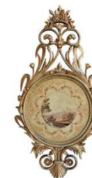
PRODUCT CODE: ANA -084533X-F DESCRIPTION: DECORATIVE PANEL MODEL NO: LP-F0905-LALV-M DIMENSION: 74.5 X 146 H CM. CLASSIFICATION : CLASSIC