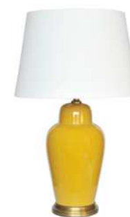
PRODUCT CODE: JING-084917X-F DESCRIPTION: JAR LAMP W/SHADE MODEL NO: JCO-X9842 DIMENSION: DIA. 43 X 69 H CM. FINISH COLOR: GOLD CLASSIFICATION : CLASSIC