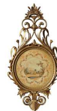
PRODUCT CODE: ANA -084534X-F DESCRIPTION: DECORATIVE PANEL MODEL NO: LP-F0906-LAVL-M DIMENSION: 75 X 5.5 X 146.5 H CM CLASSIFICATION : CLASSIC