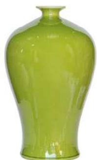
PRODUCT CODE: JING-084936X-F DESCRIPTION: 12" JAR MODEL NO: JCD-6423 DIMENSION: DIA. 20 X 32 H CM FINISH COLOR: YELLOW GREEN CLASSIFICATION : CLASSIC