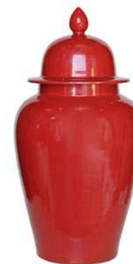
PRODUCT CODE: JING-084934X-F DESCRIPTION: 15" JAR MODEL NO: JCU-1170 DIMENSION: DIA. 21 X 41 H CM. FINISH COLOR: RED CLASSIFICATION : CLASSIC