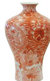
PRODUCT CODE: JING-084963X-F DESCRIPTION: VASE MODEL NO: JDC-9385 DIMENSION: DIA. 26 X 41 H CM. CLASSIFICATION : CLASSIC