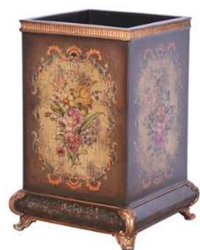
PRODUCT CODE: ANA -084547X-F DESCRIPTION: DECORATIVE WASTE BIN MODEL NO: RS-1285-WBJK-M-27 DIMENSION: 24.5 X 24.5 X 35.5 H CM CLASSIFICATION : CLASSIC