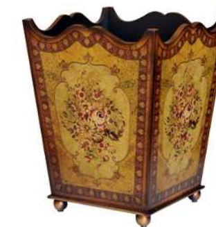
PRODUCT CODE: ANA -084551X-F DESCRIPTION: WASTE BIN MODEL NO: RS-F1419-WBQX-M-256 DIMENSION: 25 X 25 X 32 H CM. CLASSIFICATION : CLASSIC