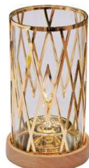
PRODUCT CODE: LIO -091811X-F DESCRIPTION: CANDLE HOLDER MODEL NO: MZ4080L DIMENSION: DIA. 16 X 27 H CM. FINISH COLOR: METAL+GLASS CLASSIFICATION : TRANSITIONAL