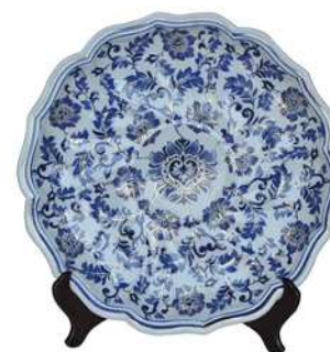
PRODUCT CODE: JING-084943X-F DESCRIPTION: 19" PLATE W/WOODEN BASE MODEL NO: JCD-7150 DIMENSION: 47.5 X 14 X 49 H CM. CLASSIFICATION : CLASSIC