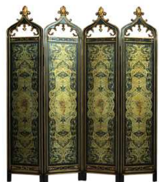
PRODUCT CODE: ANA -084471X-F DESCRIPTION: SCREEN MODEL NO: LF-A0782-LAZM-M DIMENSION: 181 X 212 H CM. CLASSIFICATION : CLASSIC