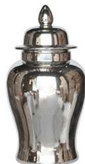
PRODUCT CODE: JING-084924X-F DESCRIPTION: 25" JAR MODEL NO: JCU-1364 DIMENSION: DIA. 32 X 62 H CM. FINISH COLOR: SILVER CLASSIFICATION : CLASSIC