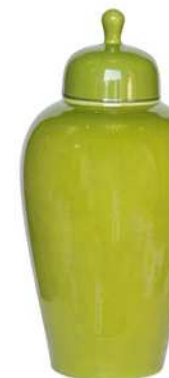
PRODUCT CODE: JING-084922X-F DESCRIPTION: 17" JAR MODEL NO: JCU-1163 DIMENSION: DIA:24X36H CM. FINISH COLOR: YELLOW GREEN CLASSIFICATION : CLASSIC