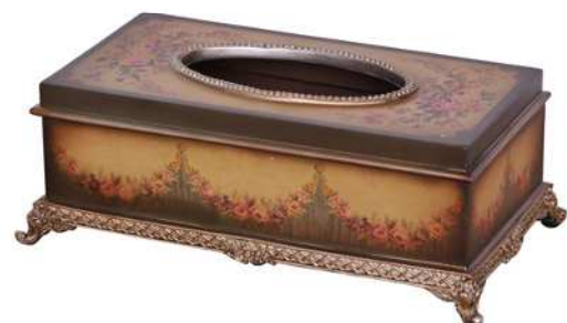
PRODUCT CODE: ANA -084545X-F DESCRIPTION: TISSUE BOX MODEL NO: RS-0848-WBBT-M DIMENSION: 30.5 X 17.5 X 11 H CM CLASSIFICATION : CLASSIC