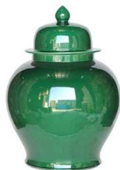
PRODUCT CODE: JING-084923X-F DESCRIPTION: 18.5" JAR MODEL NO: JCU-1171 DIMENSION: DIA. 32 X 43 H CM. FINISH COLOR: DARK GREEN CLASSIFICATION : CLASSIC