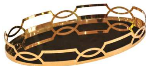
PRODUCT CODE: LIO -091814X-F DESCRIPTION: TRAY MODEL NO: MS4042S DIMENSION: 39 X 22 X 5 H CM. FINISH COLOR: STAINLESS STEEL CLASSIFICATION : TRANSITIONAL